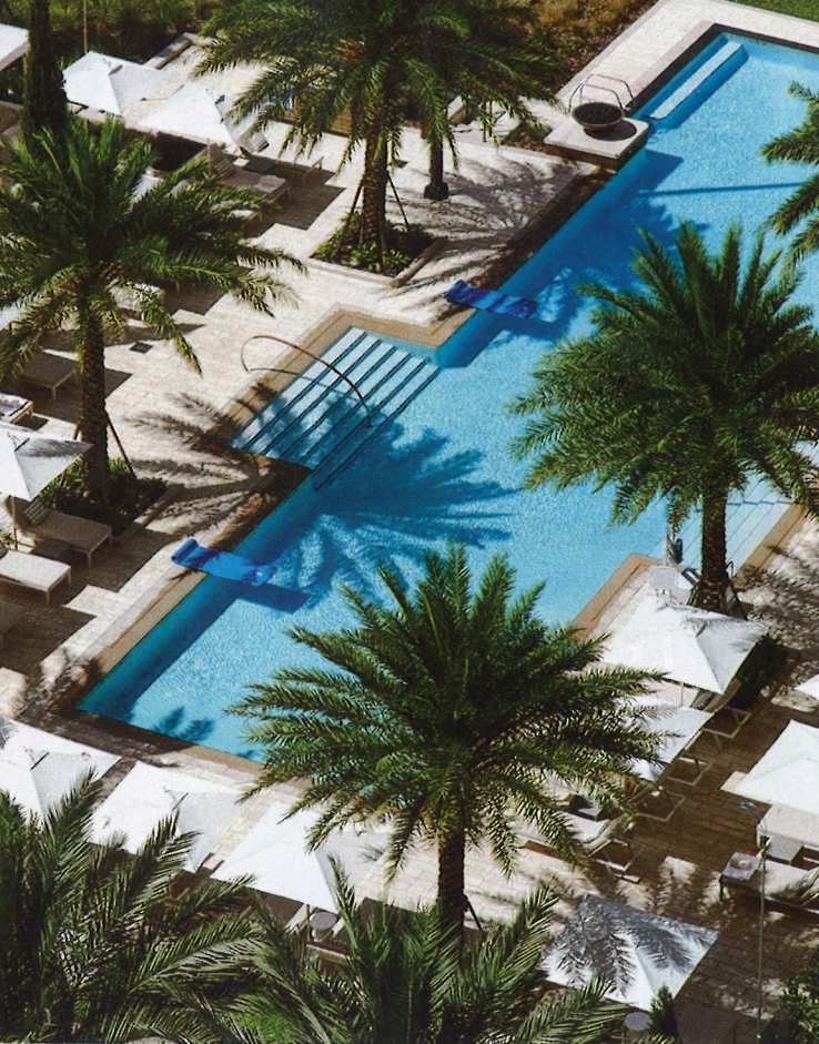
From left: The adults-only Oasis Pool at the Four Seasons Resort Orlando; Ravello, the hotel's Italian restaurant.