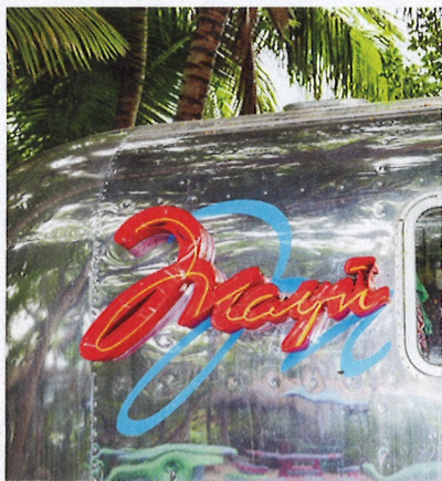
From top: Mayú on the Bay, a boutique at the Moorings Village & Spa, in Islamorada; a view from the Thompson Miami Beach.

From Key Largo, I continue down U.S. 1, stopping in for smoked lobster at Casa Mar Fresh Seafood Market (Rte. 1; 305/440-3935), in the town of Tavernier, before arriving in Islamorada. A traditional haven for sport fishermen—a roll call that includes Winston Churchill and Paul Newman—Islamorada has lately earned the reputation as the most sophisticated of the Keys. My hotel, the 18-cottage beachside Moorings Village & Spa ( themooringsvillage.com ; $$$$), is surrounded by bougainvillea and coconut palms, and there's a cool pop-up boutique nearby called Mayú on the Bay in an Airstream trailer filled with pieces by Roberta Freymann, Letarte, and others. Come evening, I head to chef George Patti's slick new S.A.L.T Fusion Cuisine & Caña Lounge ( salt-fusion.com ; $$$) for a plate of Manchego grits and seared shrimp in chorizo cream sauce, a welcome leap from the fish-fry-palace era of the old Keys.